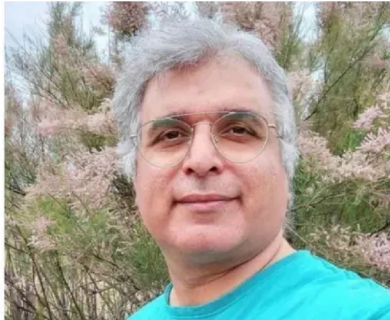
پیام ولی شهروند بهایی محبوس در زندان قزلحصار به نشر اکاذیب متهم شد