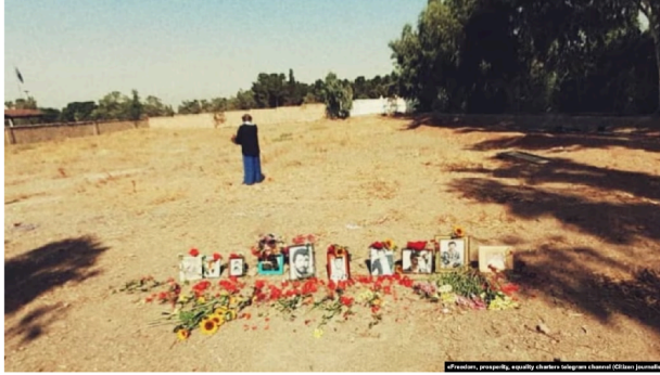
گورستان خاوران - آرشيو

گزارش‌ها حاکی از «برخورد خشونت‌آمیز» ماموران با تعدادی از خانواده‌های زندانیان سیاسی اعدام شده در دهه ۶۰ و تابستان ۶۷ در گورستان خاوران در شرق تهران است.