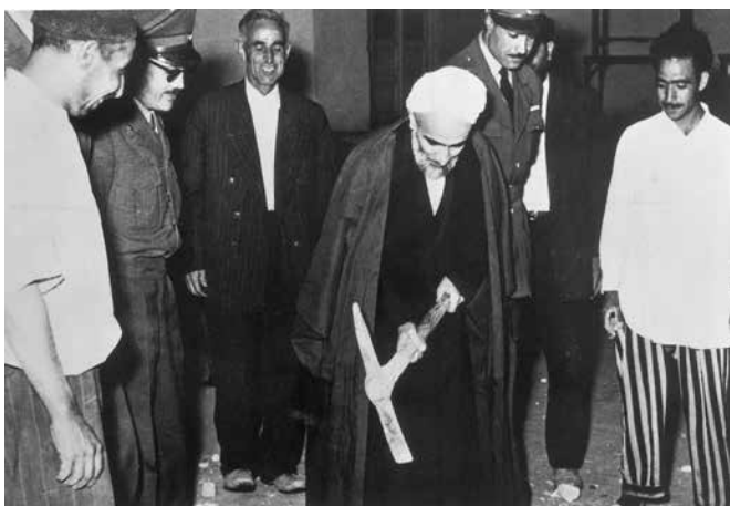
Muslim leaders and members of the Shah's army destroyed the National Bahá'í Center with pickaxes in Tehran in 1955 after a radical cleric began broadcasting anti-Bahá'í rhetoric on national radio.

During the 20th century, periodic outbreaks of violence against Bahá'ís continued, with the government often using them as a scapegoat. In 1933, for example, Bahá'í literature was banned, Bahá'í marriages were not recognized, and Bahá'ís in public service were demoted or lost their jobs. In 1955, the government oversaw the demolition of the Bahá'í national center in Tehran and many Bahá'í homes were plundered after a radical cleric began broadcasting anti-Bahá'í rhetoric on national radio.