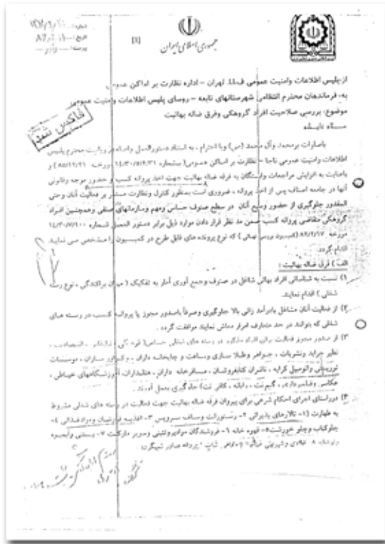
Facsimile of 9 April 2007 letter from the Public Places Supervision Office of the Public Intelligence and Security Force in the province of Tehran. Addressed to regional commanders of police and the heads of public intelligence and security forces, the letter instructs them to prevent members of the “perverse Bahaist sect” from engaging in a wide range of businesses.

commanders of police and the heads of public intelligence and security forces, that letter instructs them to prevent members of the “perverse Bahaist sect” from engaging in a wide range of businesses. These include “high-earning businesses,” “sensitive business” categories, such as the press, engraving, the tourist industry, car rentals, publishing, hostel and hotel management, photography and film, computer sales, and Internet cafés, and food businesses which might offend Shia concepts of “cleanliness.”