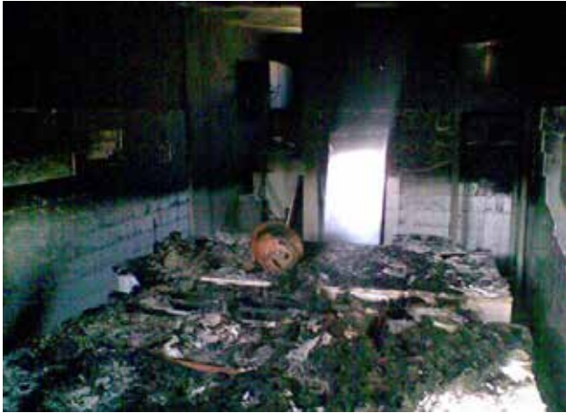
Interior view of a mortuary building used to prepare bodies in the Semnan Bahá'í cemetery, after being attacked by arsonists in February 2009.

Within weeks of those rallies, on 15 December 2008, the homes of some 20 Bahá'ís were raided by authorities at dawn. Bahá'í materials, computers, and mobile telephones were seized. Nine Bahá'ís whose homes were raided were arrested, one at the time of the raids and eight more later,