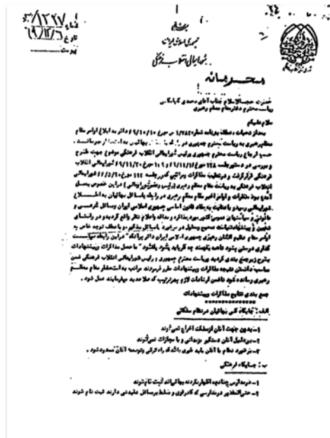
The 1991 secret memorandum on the "Bahá'í Question." The full document is reproduced on page 34.

The memorandum also spells out the conditions under which Bahá'ís can be arrested and imprisoned, offering a rationale for such arrests without raising undue international attention. The docu-